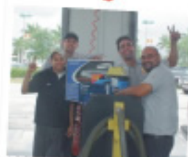
The Best Team, Shell Rapid Lube-Perma.